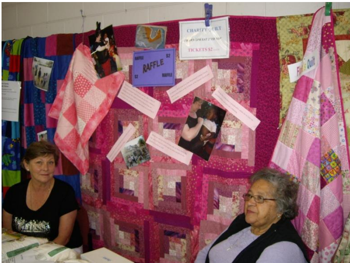
Some Community Program quilters at Blackwood Uniting Church Hall, with the quilt being raffled for Flora, and the mini-quilt that was given to Flora. November 2010.

November 2010 BUC Community Program Patchwork and Quilter classes raffle for Flora