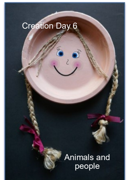
Creation Day 6

We would be interested to know your ideas for displaying your Creation Days.