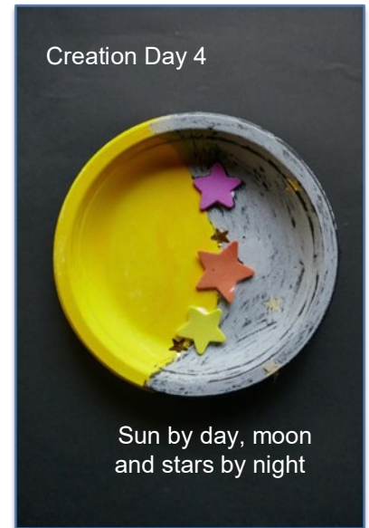
Creation Day 4

The sun was painted yellow. We painted the moon but decided it was too dark so we coloured over it with a light grey crayon. Raiding the craft box again we found some foam stars and some gold reward stickers.