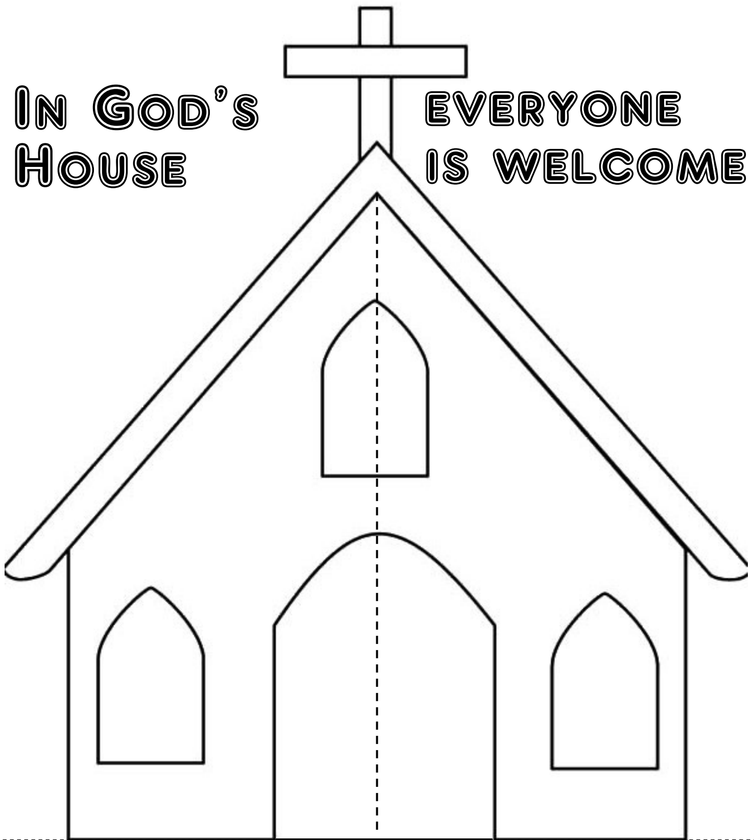
Picture 1 Free download from https://www.tocolor.pics/church-outline-coloring-pages/

Find another housecraft at https://www.dltk-kids.com/crafts/miscellaneous/printable_paper_house_craft.htm