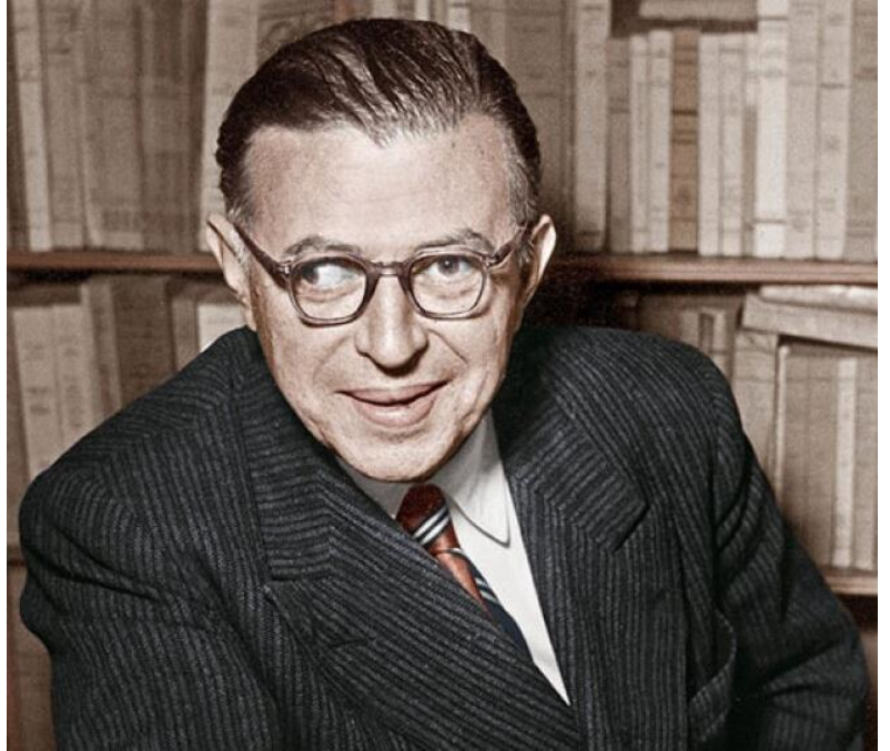
Jean-Paul Sartre 1905-1980 French writer and philosopher

“Once freedom lights its beacon in a person’s heart, the gods are powerless against it.”